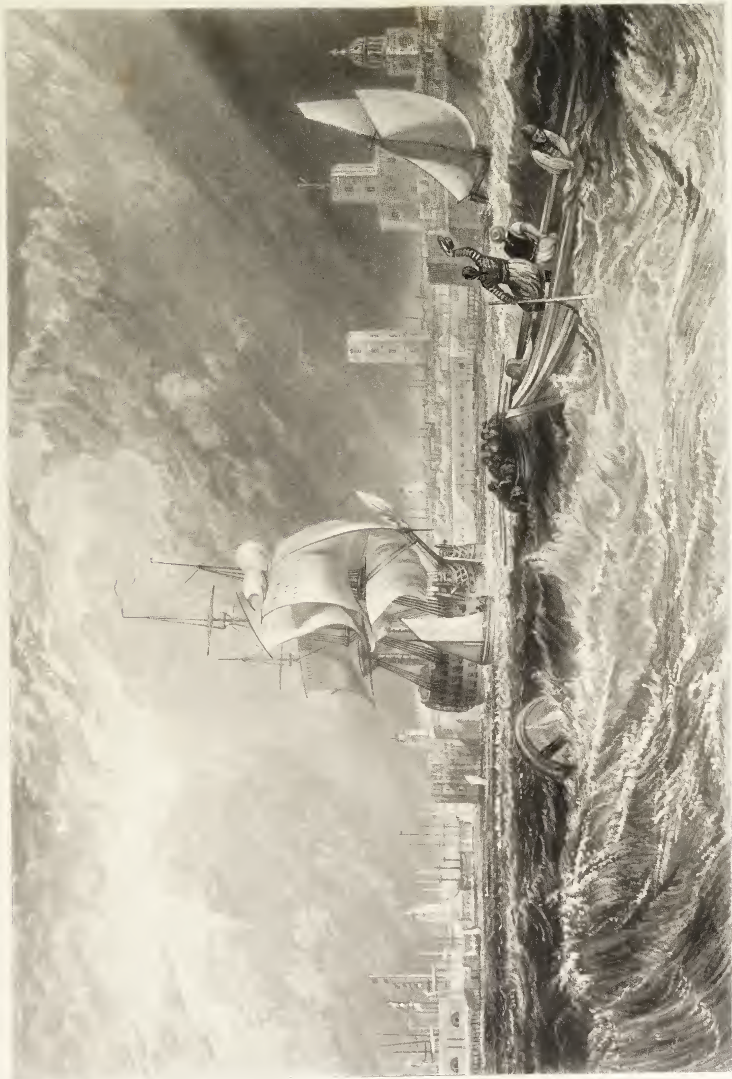
Engraved by The 'Lupton